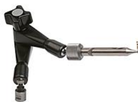
Clamping joint with small parts clamp