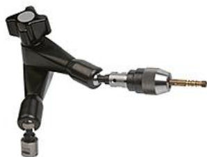
Clamping joint with precision small chuck