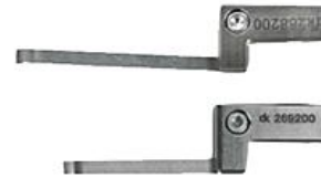
spring clamp for horizontal clamping right/left