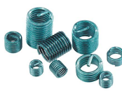
spare threaded inserts, loose